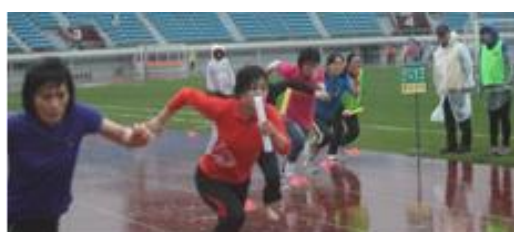
6 th Athletic Event for Social Workers