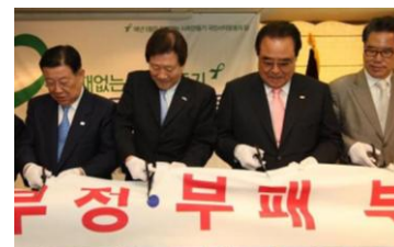
At the declaration ceremony for the ‘Campaign for the National Promise to Make a Society without Corruption’

Faced with challenges like poverty and climate change, globally and domestically, with challenges like economical polarization and societal conflict, the KASW, as a professional organization of social workers, will observe the UN Global Compact’s 10 principles, and continuously pursue and come up with new directions for social unification based on a sense of social responsibility.