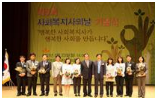
Award Recipients of 2012 Social Workers' Day

Furthermore, it held a workshop as a special program of this year, with the theme: "2012 Current Issues and Challenges of International Social Work" which was attended by social workers working in the field of international cooperation and people who are interested in international social work. The workshop was designed to introduce the "Global Agenda on Social Work and Social Development" which has been promoted since 2010, and to encourage Korean social workers to participate in it. The workshop, held on March 20, on "World Social Work" was a good opportunity to report to social workers in Korea the progress on the promotion of the "Global Agenda on Social Work and Social Development", and the trends and activities of international social work.