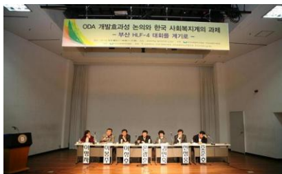
Discussions at the Seminar

The seminar served as a starting point for social workers in Korea to take an active part in the field of international development cooperation and actively cope with a number of challenges facing international societies. The KASW, with a continuous interest in development cooperation, intends to make an effort to draw social workers’ attention to it and encourage them to be involved in it. In November 2012, under the support of the Korea International Cooperation Agency (KOICA) and the Korea Association of International Development and Cooperation (KAIDEC), the KASW will hold a forum titled ‘2012 Social Work and Social Development: the Role of Social Workers and the Challenges Faced’. Its purpose is to search for social workers’ roles and future directions responding to the challenges faced in the field of international development cooperation.